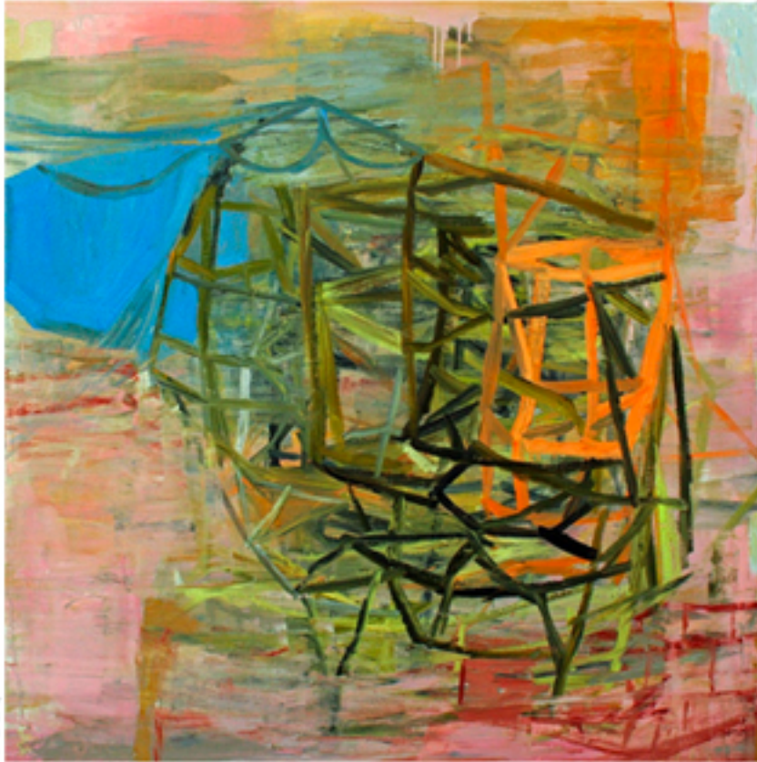
Deborah Dancy, The Object of My Affection , 2013. Oil on Canvas, 46 x 46 inches.