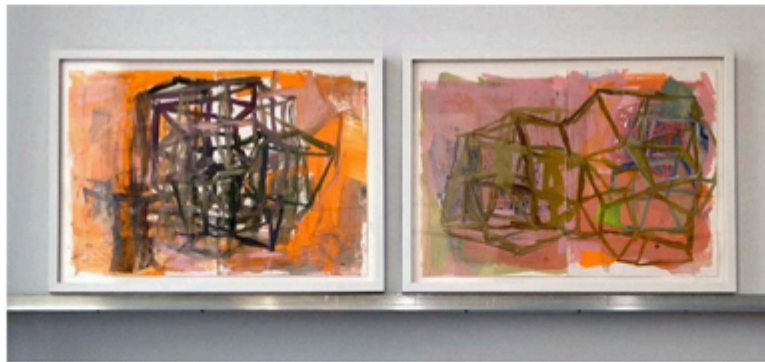
Deborah Dancy, Opus Incertum 3 , 2013. Acrylic on paper, 20 x 28 inches each.

Dancy uses drawing in her paintings and works on paper to bridge the gap between abstraction and figuration through the intersection of line, color, and gesture. Dancy's finished works highlight her process of adding and subtracting paint to attain a particular color palette and surface texture. Her architecturally drawn lines are fundamental to the compositions, holding their own prominence without taking away from the colors that cushion them. Where sharp edges meet soft tones, a conversation between severity and serenity begins and continues throughout the show. Although the style in which Dancy paints seems impulsive, the overall organization of shape and color indicates thought and control.