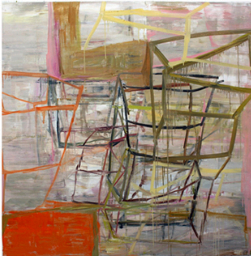
Deborah Dancy, Point Counter Point , 2013. Oil on canvas, 60 x 60 inches.