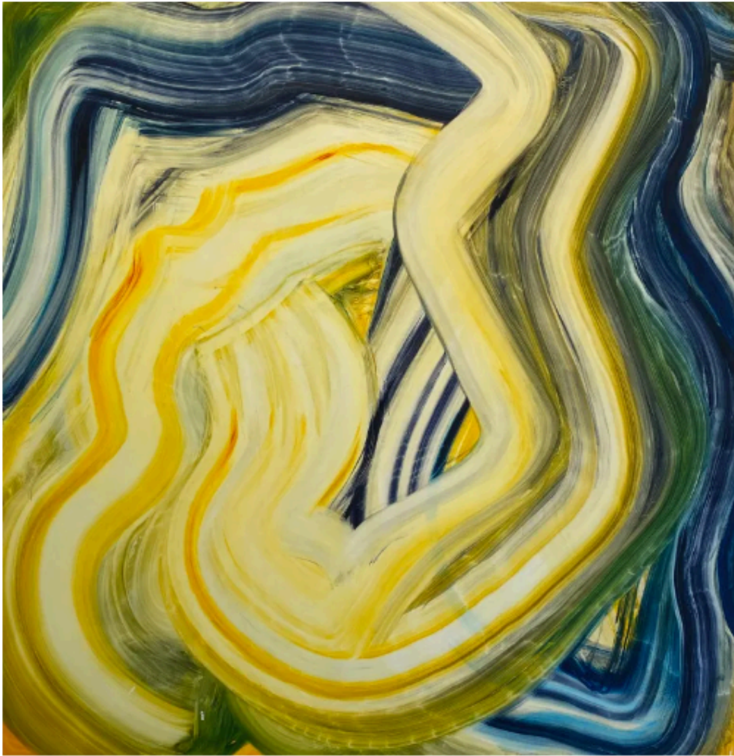
Fran O'Neill, golden travel , 2021, oil on canvas, 48 x 48 inches

Not inconsistently with this rather humanistic idea, there are hints of figuration in O'Neill's work. Her use of intense color with tonal variation suggests a figure-ground relationship, reinforced by shifts in the width of the brushstrokes. The very large painting low hang highlights this quality. Uniform folds of black and white marks hover in front of a darker gray backdrop in a shallow yet dimensional space. Likewise, in the smaller taking stock , the dominant scythe-like purple shape is formed from a series of urgent marks, below which softer U-shaped marks seem to recede. This distinctive visual play recalls the work of Leslie Vance , another artist whose work has demonstrated the versatility of the picture plane.