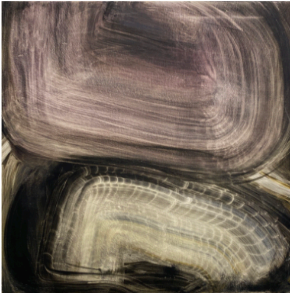
Fran O'Neill, untitled, 2021, oil on canvas, 24 x 24 inches