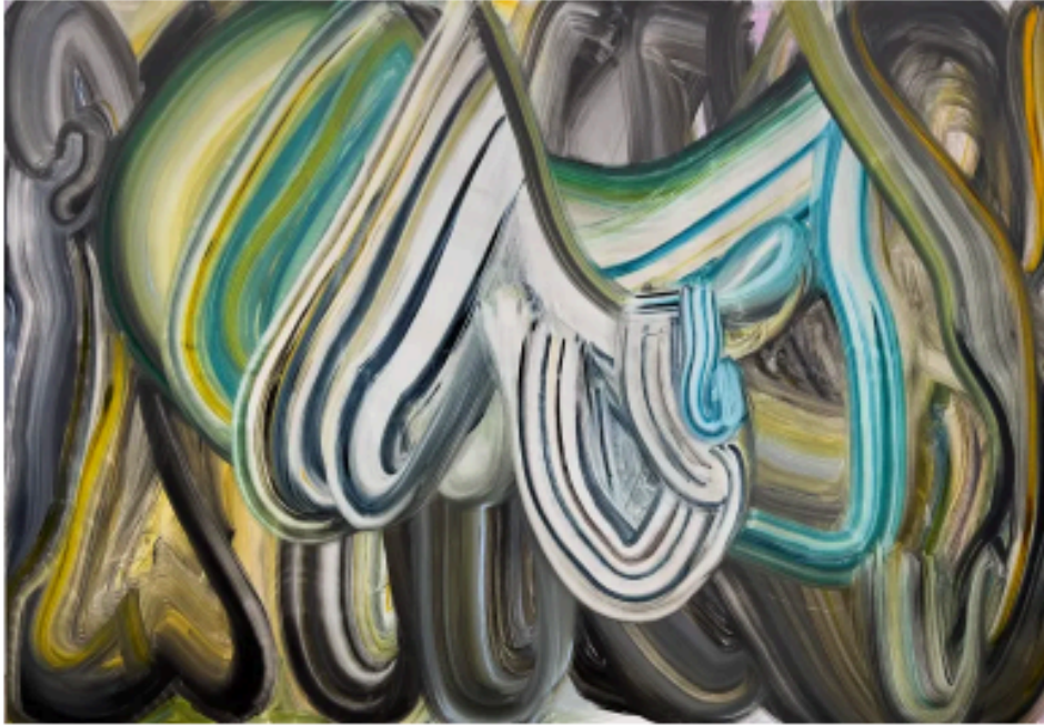
Fran O'Neill, low hang, 2022, oil on canvas, 70 x 100 inches